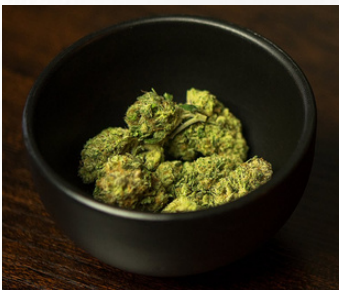
Dried cannabis flower.

Image source: Wikimedia.org. June 7, 2009. Public Domain.