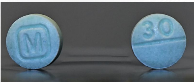
Fentanyl in pill form.