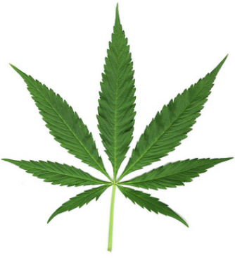
The Cannabis sativa leaf.

Image source: Wikimedia.org. June 7, 2009. Public Domain.