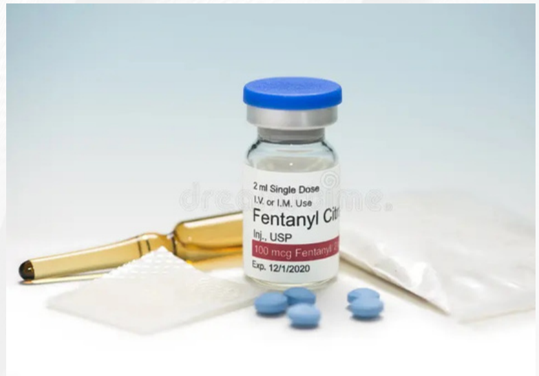
Fentanyl citrate in liquid, injectable form.